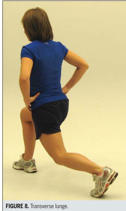
FIGURE 8. Transverse lunge.