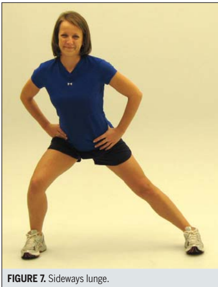
FIGURE 7. Sideways lunge.