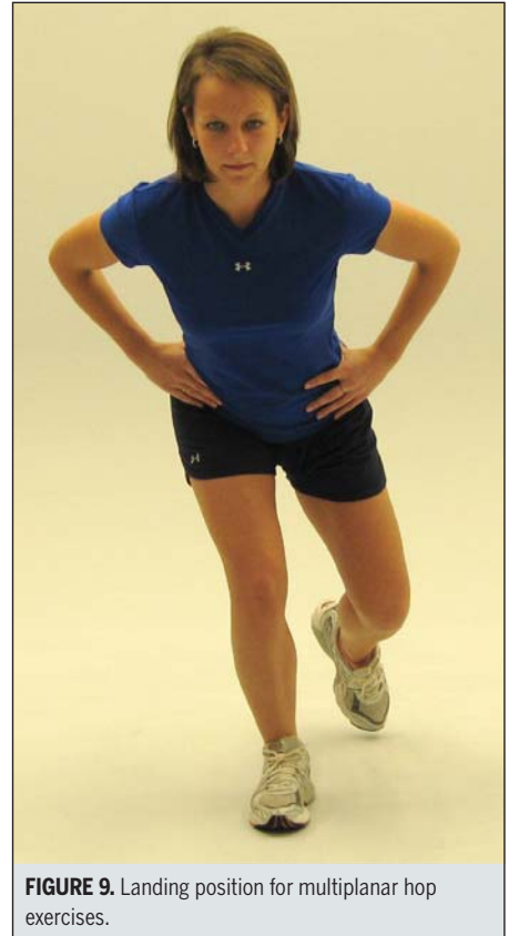
FIGURE 9. Landing position for multiplanar hop exercises.

ground. Subjects were instructed to keep their knees over the toes for all lunges. Subjects lunged forward, sideways (towards their dominant side), and rotated towards their dominant side. During the transverse-plane lunge, subjects rotated 135° on their nondominant limb towards their dominant side. Subjects twisted and lunged forward in this direction with consecutive motion (FIGURES 6-8).