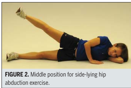
FIGURE 2. Middle position for side-lying hip abduction exercise.