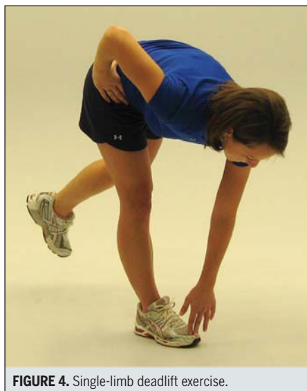
FIGURE 4. Single-limb deadlift exercise.