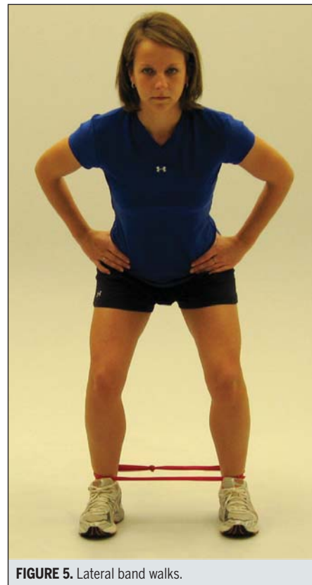
FIGURE 5. Lateral band walks.

together and their anterior superior iliac spines facing forward, and then returned to the starting position ( FIGURE 1 ).