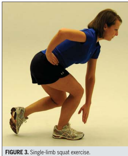
FIGURE 3. Single-limb squat exercise.