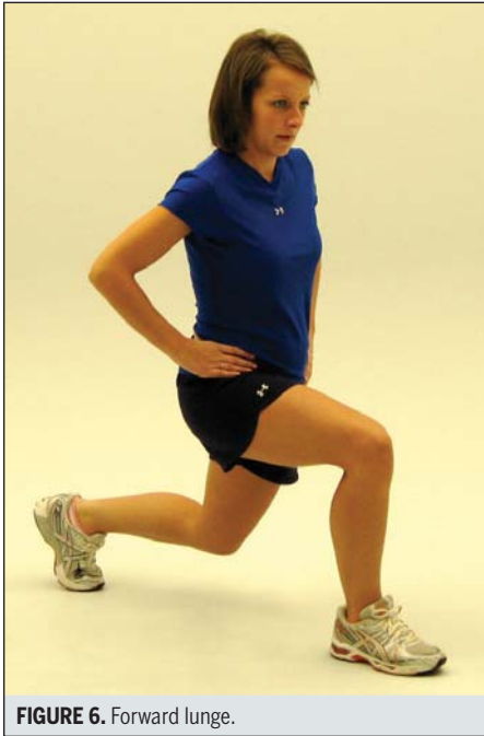
FIGURE 6. Forward lunge.